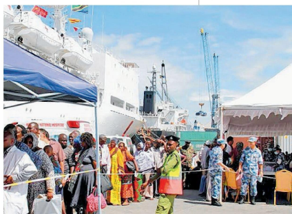
Local patients board the Chinese naval hospital ship Peace Ark to receive free medical services in Dar es Salaam on November 20, 2017.